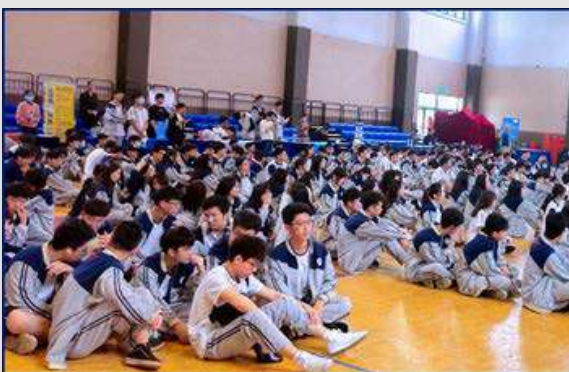
100+ High School offline Info Session