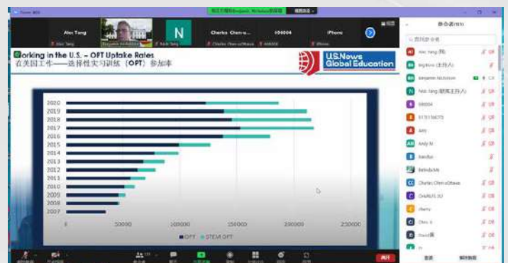
Online Education Exhibition Management

"Your one-stop marketing agency to succeed in the Chinese market."