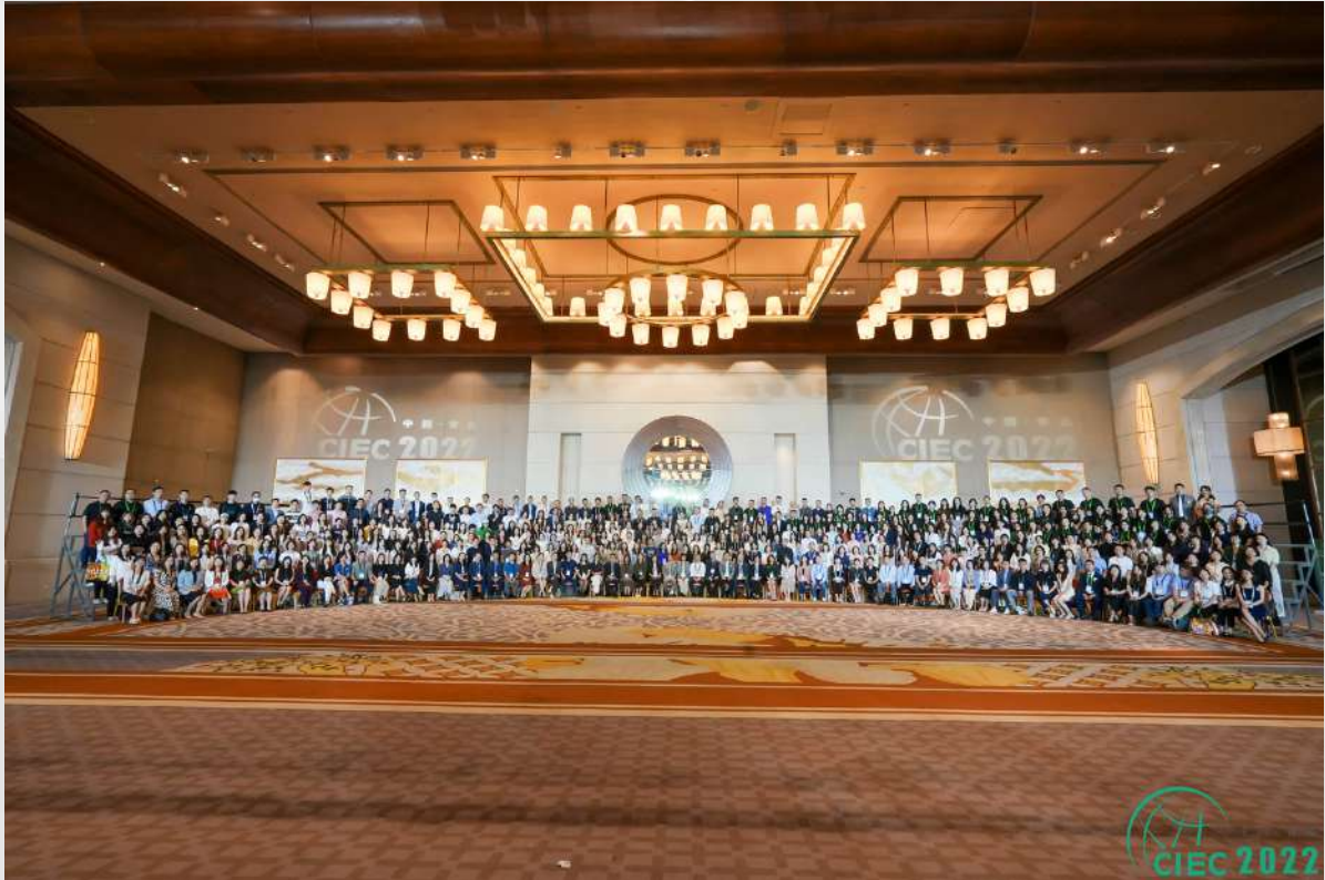
2022 CIEC International Education Conference